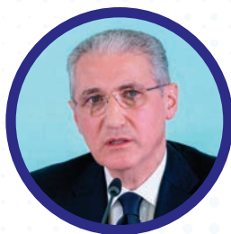
Mukhtar Babayev Representative of the President of the Republic of Azerbaijan on Climate Issues, COP29 President